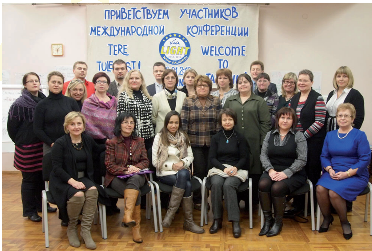
The first meeting of VIA LIGHT participants in Tallinn (Estonia), January 2012